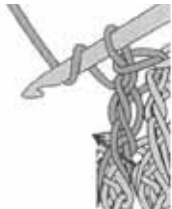
1tr in base loop of bptr

2 nd rnd: 1dc in next tr, *2ch, 3tr in 1chsp, 2ch, miss 1tr, 1dc in next tr, rep from * twice more, 2ch, 3tr in 1chsp, 2ch, slst in first dc.